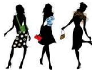
Do you Dress to Impress?